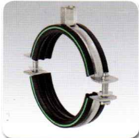
DÄMMGULAST® vibration control lining

TO KNOW MORE ABOUT THIS PRODUCT SCAN THIS CODE WITH ZAPPAR APP Download on the App Store | Google play