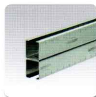
MPC-Support Channels 38/80 Sizes: 2 m/4 m/6,64 m