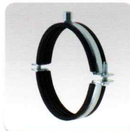
Vibration control lining