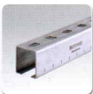
MPC-Support Channels 38/40 Sizes: 2 m/3,04 m/6 m