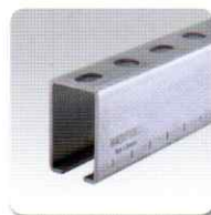
MPC-Support Channels 40/60 Sizes: 2 m/3,04 m/6 m