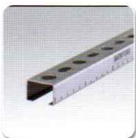
MPC-Support Channels 27/18 Sizes: 1 m/2 m/6 m

MPC-Support channels are a quick and efficient attachment of pipe sections and multiple pipe ways. The scale marks sideways and on the side with the slot simplify the alignment of the attachment elements during installation and facilitate the measuring and cutting to length of the section on site.