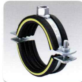
DÄMMGULAST® vibration control lining