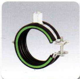
DÄMMGULAST® vibration control lining